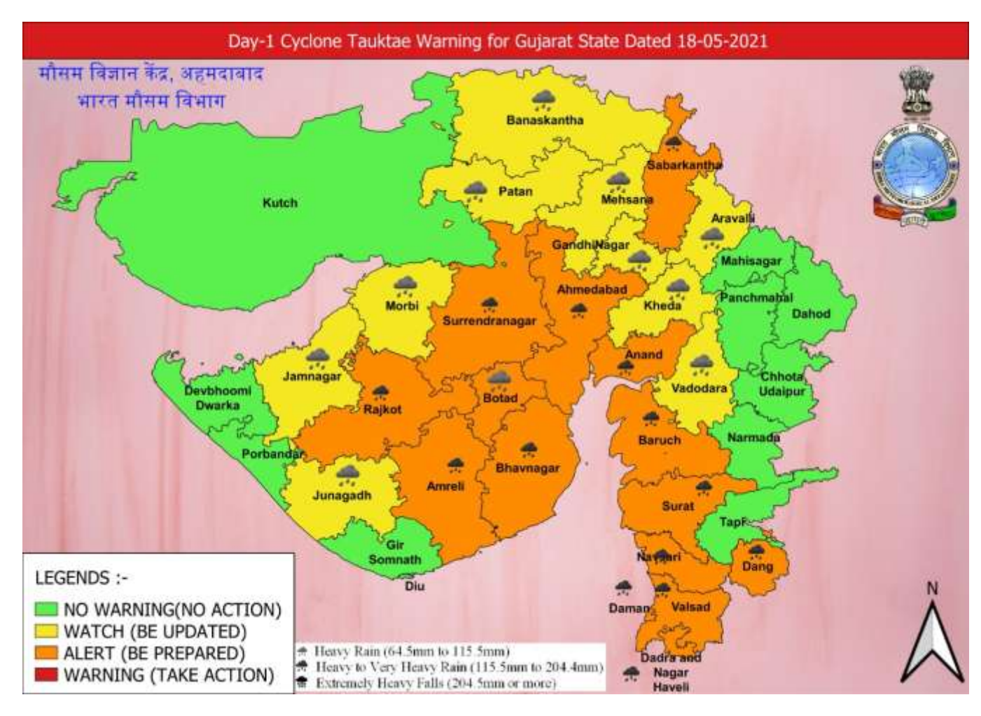
HEAVY RAINFALL WARNING FOR GUJARAT STATE FROM 0830 HOURS IST OF 18 ^{\text{TH}} TO 0830 HOURS IST OF 19 ^{\text{TH}} MAY